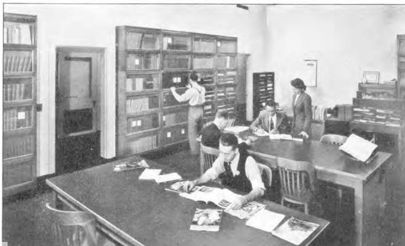
FIGURE 1. View of the technical library.

At the General Radio Company, twenty-seven engineers are exclusively engaged in the development and design of electronic instruments. Drafting, model shop and secretarial employees boost the total of de-